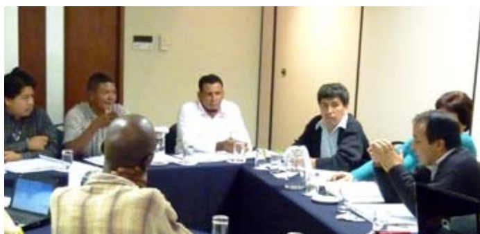
Latin American indigenous peoples' meeting, Peru

Driven by Motion 8 from the 2008 General Assembly, FSC organized the meetings to provide indigenous people a platform to discuss and agree on common feedback on Draft 2-0 of Version 5-0 of the Principles and Criteria. The scope of the regional meetings covered all ten principles and associated criteria, though participants focused on Principle 3 which deals with indigenous and traditional peoples' rights.