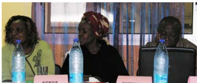
African-Congo Basin indigenous peoples' meeting, Cameroon