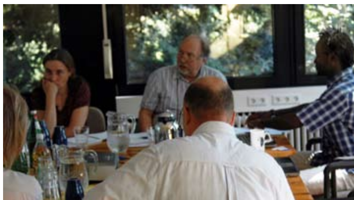
European indigenous peoples' meeting, Germany

For the first regional meeting, eleven indigenous people from seven countries congregated in Peru's capital on 3 August 2009, including representatives from Bolivia, Chile, Colombia, Guatemala, Honduras, Nicaragua and Peru.